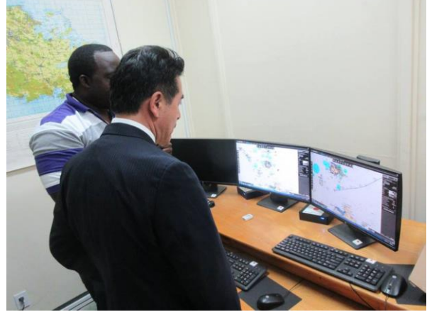
H. E. Sato in a visit to the Point Wharf Fisherv Complex