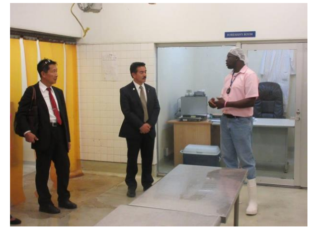
H. E. Sato in a visit to the Point Wharf Fisherv Complex